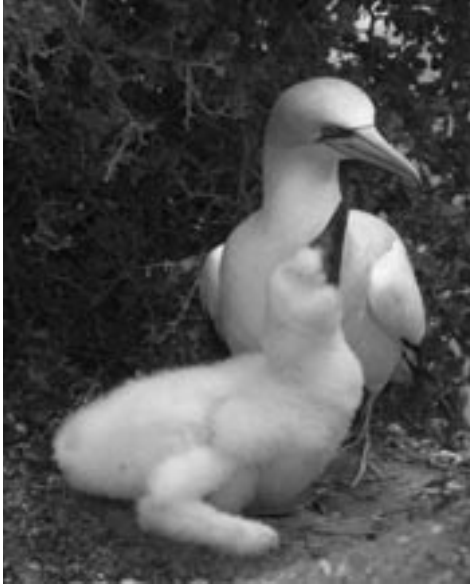
He pīpī tākapu me tana matua

Ka pakeke te kōhungahunga, ka rere atu ki Ahitereiria mā Te Tai-o-Rehua i te mutunga o te raumati. Ka noho aua manu i reira mō ngā tau e rima pea. Kātahi anō aua manu ka hoki mai ki Aotearoa.